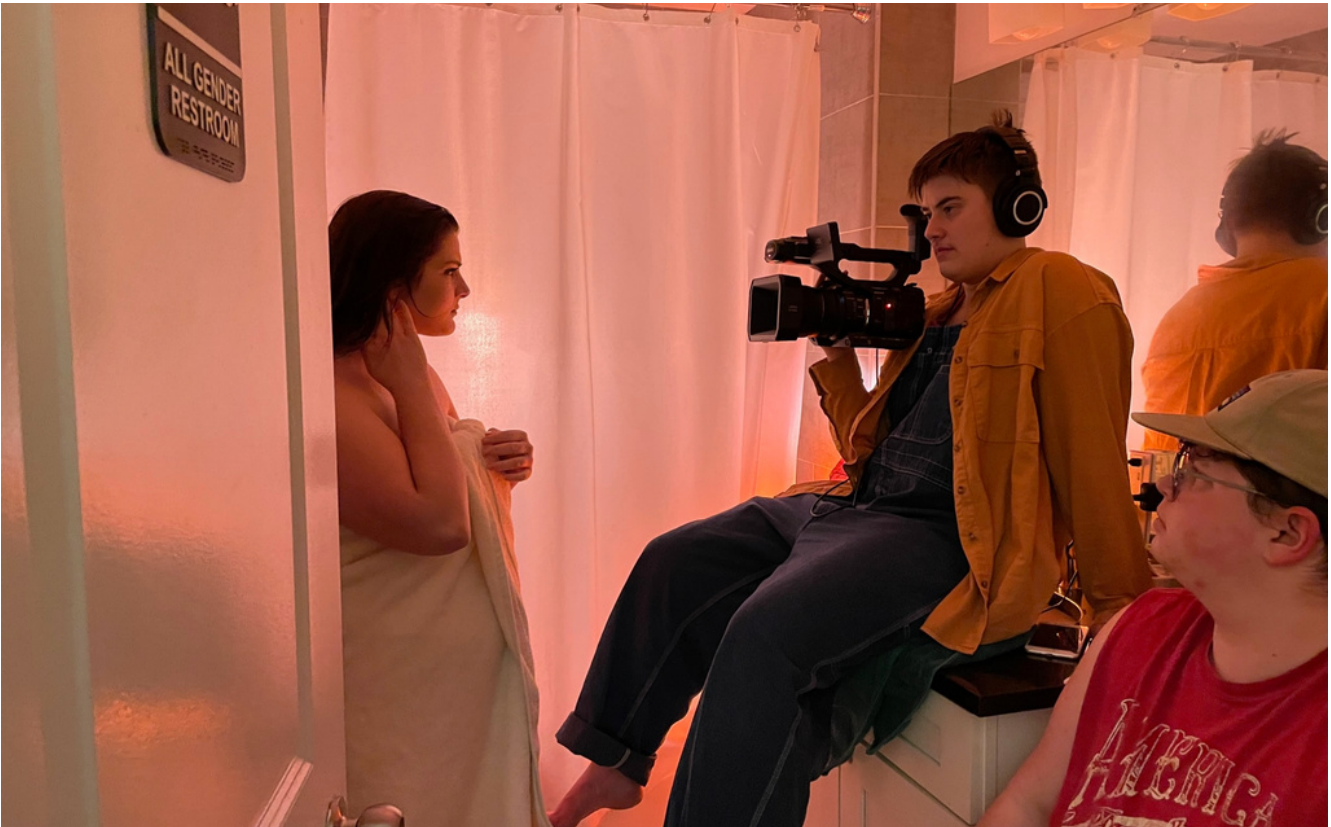
BTS of 'Incubus' (2024)